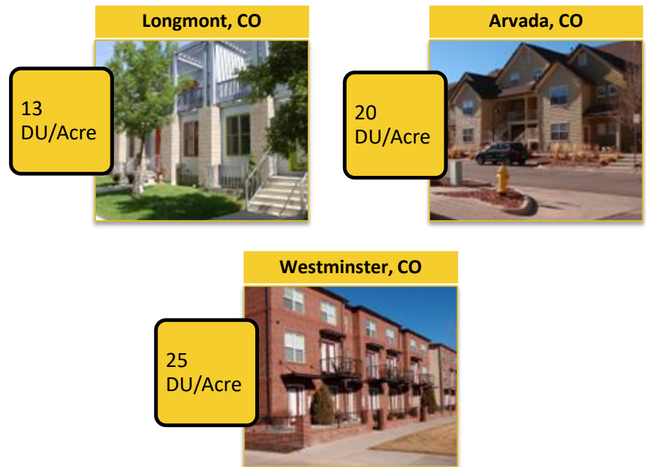
Figure ES 2: Examples of Dwelling Unit Density

mile of station areas as a guide for initiating BRT service. Higher densities, in excess of 42 combined residents and employment per acre, can be supported at major BRT stations like the future I-25 Multimodal Hub, and are ideal for creating highly successful BRT. These higher densities should be allowed for in planning documents and zoning or overlay requirements and can be phased in over time. For initial phases of land use development, the local jurisdictions can explore developing surface lot Park-N-Rides to help offset density requirements that may later transition into structured parking as density increases.